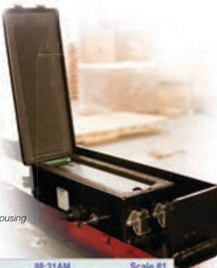
Wireless battery housing

The wired or wireless scale-to-indicator systems are available with either the CLS-920i or the CLS-420.